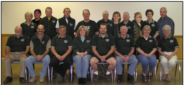
Our 2008 Directors

Please get in touch with the office, or a current member... you won't regret it! 😊