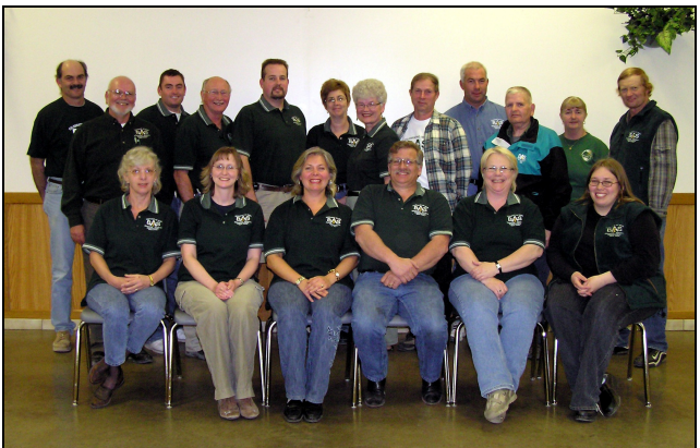
Our 2007 Directors

Please get in touch with the office, or a current member... you won't regret it! ☺